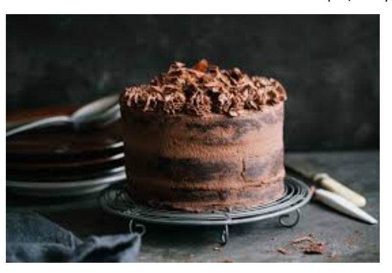
"Barely There" w/Piping on top