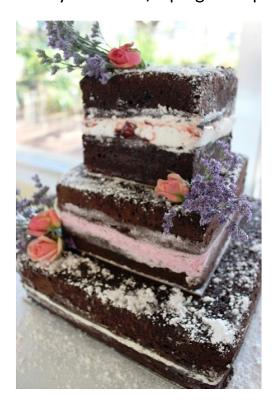
Naked Square Two Tier