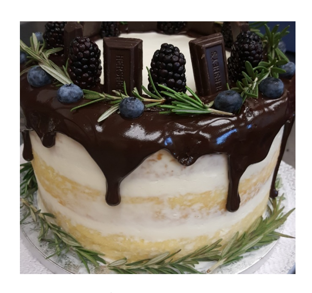
Barely There w/Chocolate Fudge, Candy & Fruit