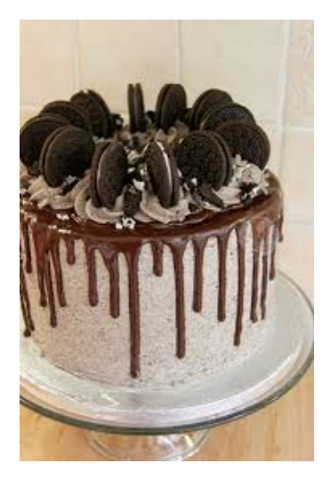
Chocolate Drip w/Candy or Cookie Topping