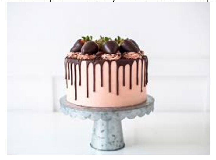
Chocolate Drip w/Chocolate Covered Strawberries