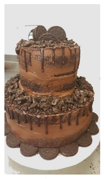
Barely There w/Cookies or Candy